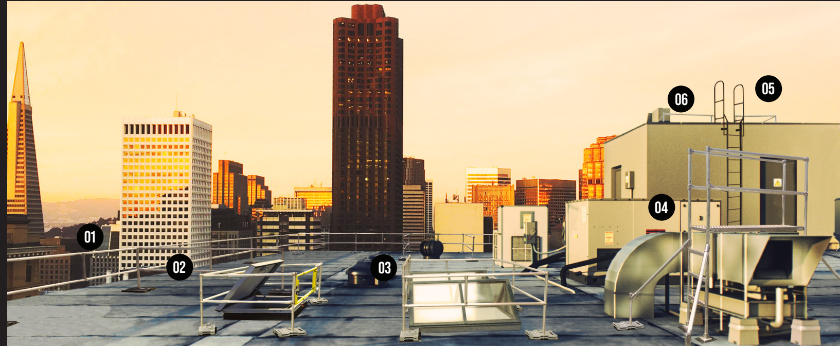
01 GARGOYLE ROOFTOP GUARDRAIL